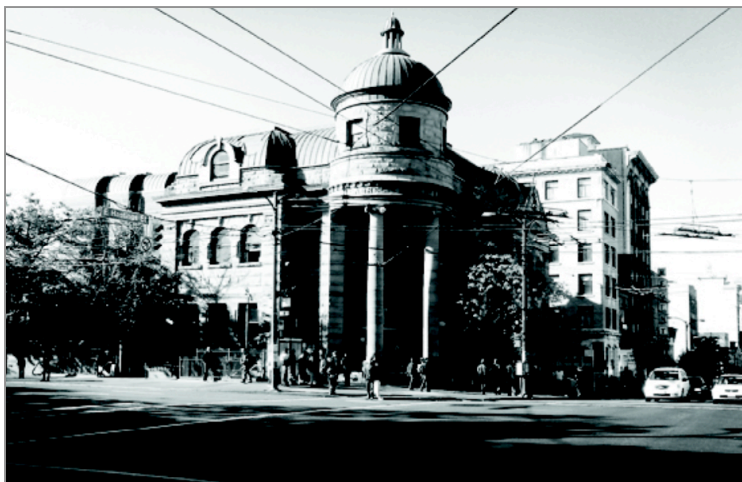
The Carnegie Community Centre at Main and Hastings

The SCORE project took place in Vancouver's Downtown Eastside (DTES). It is one of the poorest neighbourhoods in Canada. It has been estimated that approximately 16,000 people live in the DTES and that women comprise 38% of this population (City of Vancouver, 2004). The DTES is a diverse neighbourhood: 40% of its residents are Aboriginal and 20% are East Asian or Latino/a (Robertson & Culhane, 2005). The DTES has a "high concentration of social problems, including poverty, mental illness, drug use, crime, survival sex work, high HIV/Hepatitis infection rates, unemployment and violence" (PIVOT Legal Society, 2006, p. 5).