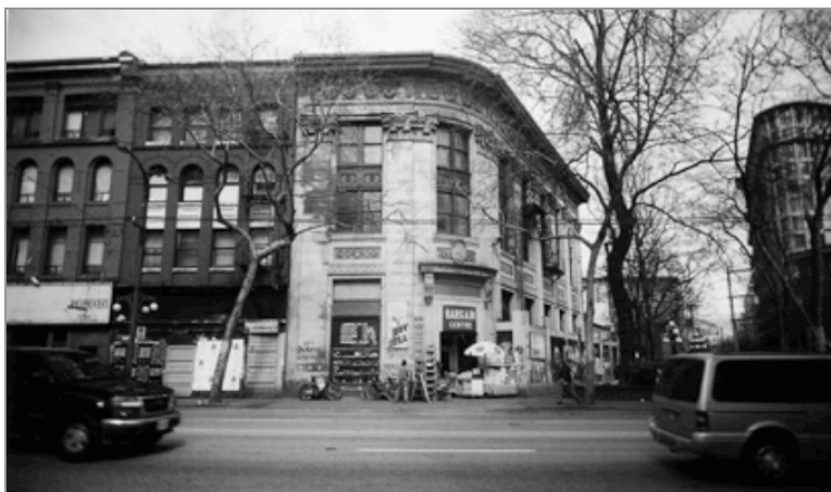
Pigeon Park

Another idea was the creation of a “bad dope 10 sheet” to circulate so that people who use crack would be aware of current trends on the street and how to use crack more safely. The women talked openly about the need for testing strategies that would tell them what was in the “dope” so that adverse reactions could be avoided.