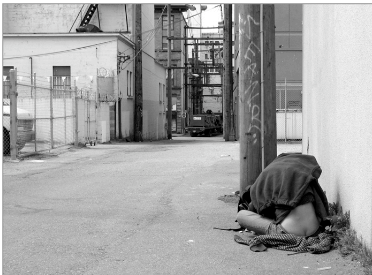
A woman smokes crack under her coat

For me, it’s just helping the girls be aware. Like harm reduction to me is educating and making people aware of how it is that what they may be doing or not doing is safe or unsafe.