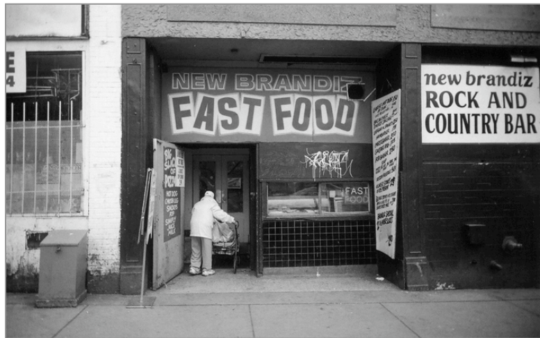
New Brandiz Bar

“The majority of people in this area are users, but without a doubt we have offered kits to people that were terribly offended by it. It was touch and go. It was back up, some people get offended easy, you know, you apologize.”