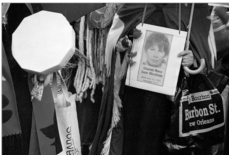
Attendees at the DTES women's memorial pay tribute to the missing and murdered women of Vancouver's DTES.

While there were components of this study that were focussed exclusively on women, we were dedicated to ensuring that women AND men who used crack had access to equipment and education that would promote safer use.