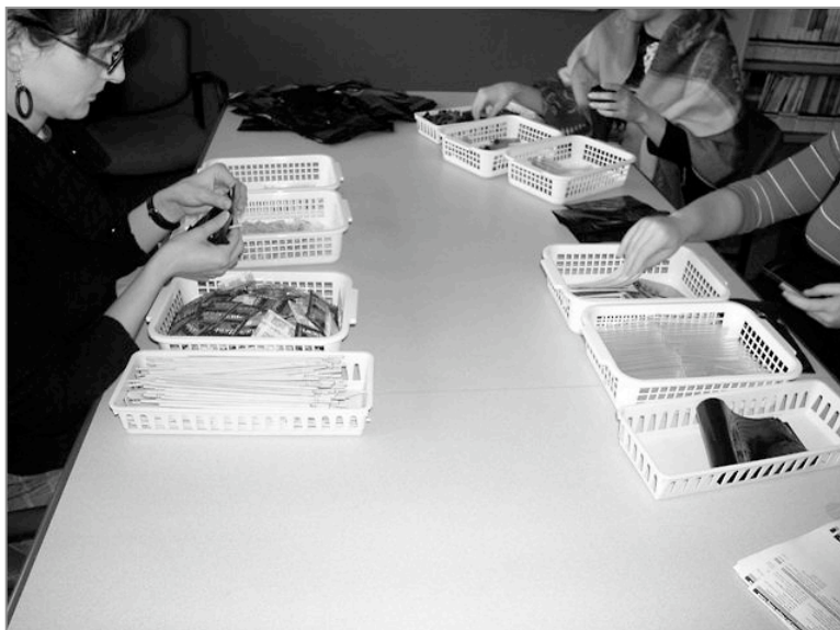
Simulation of kit-making circle at UBC.

“It means so much to get together like this and it means I didn’t have to do a date.”