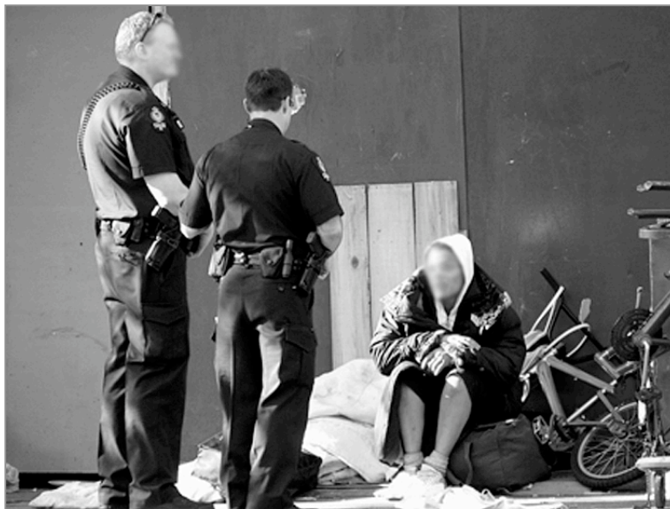
Police at Main and Hastings

credit of the Vancouver Police, toward the end of the SCORE project, officers working in the DTES were familiar with the project and refrained from confiscating harm reduction materials associated with the project.