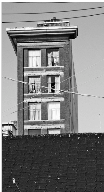
Single room occupancy building, DTES

programmes providing drug injections sites . . . (INCB, 2007: 60, 61).