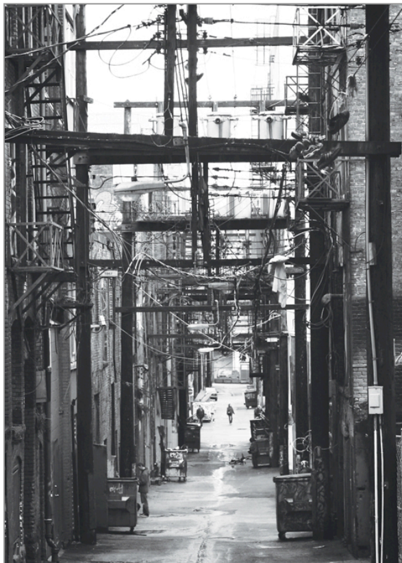
DTES Alleyway

“One of the most important things that I used to do, if someone was really interested in using the pipe and the screens is to show him or her how to do that, but it takes like two or three minutes...So meanwhile, the outreach team is surrounded by people.”