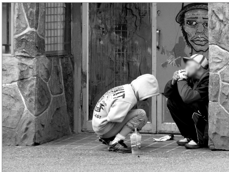
Smoking crack on West Hastings street

“Because it’s almost like an insult to me because I’ve been smoking crack for 13 years...12 or 13 years. For somebody to demonstrate to me how to load a pipe would be disrespectful in a way.”