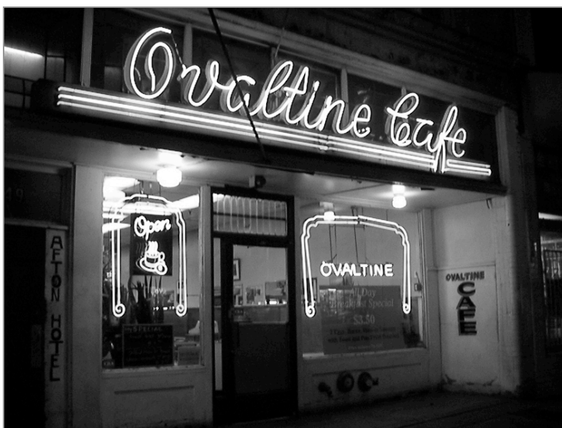
The Ovaltine Café, DTES

“I’m finding that more people are using screens and they’re telling me, and they are showing me... the screens are better for your lungs and I have emphysema, so I should be using the screens more often.”