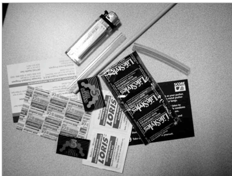
Safer crack kit contents