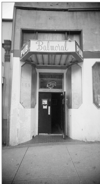
The Balmoral hotel and pub

outdoors in an alley putting them at higher risk for arrest, violence and manipulation.